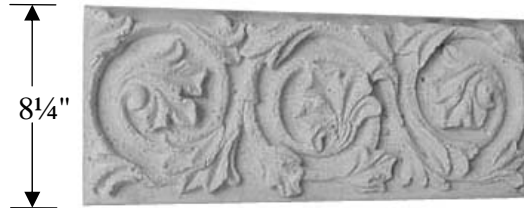
Thickness=1 1/4" FRP#07