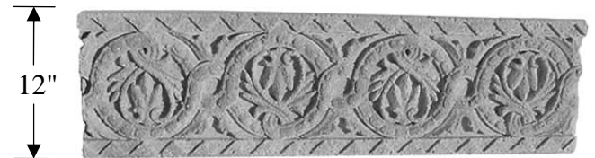
Thickness=1 3/4" FRP#09