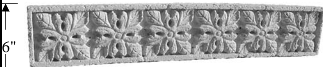
Thickness=1 1/2" FRP#14