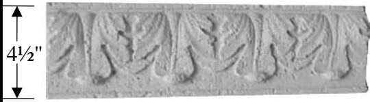
Thickness=1 1/2" FRP#06