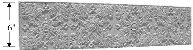
Thickness= ½" FRP#17