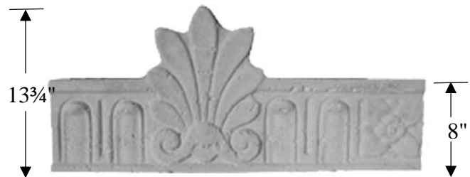
Thickness= 4¼" FRP#23 31½"